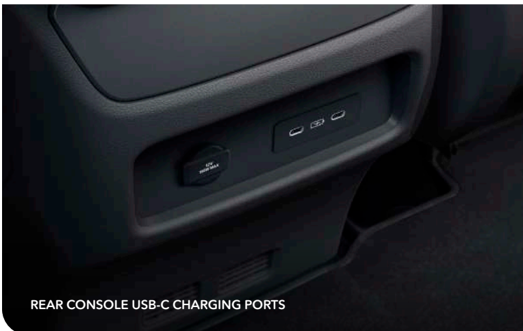
REAR CONSOLE USB-C CHARGING PORTS