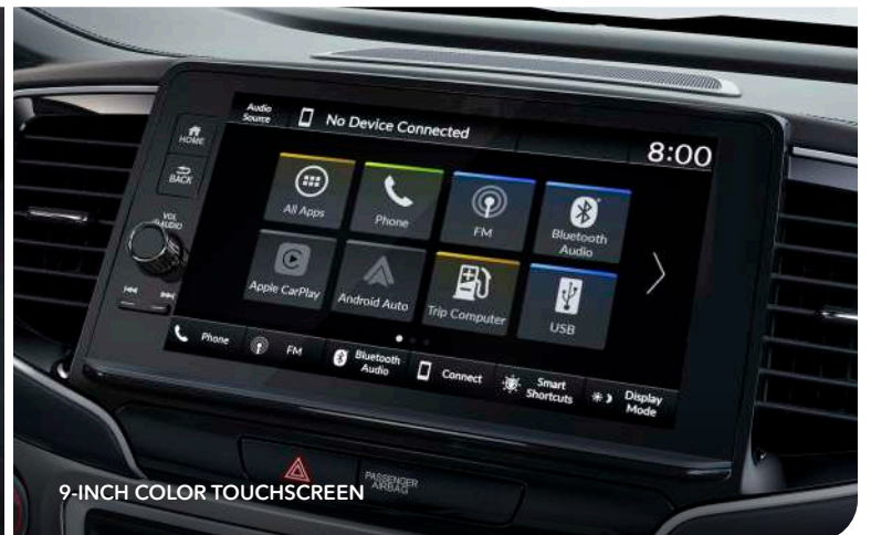
9-INCH COLOR TOUCHSCREEN