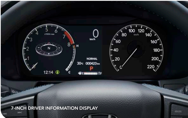
7-INCH DRIVER INFORMATION DISPLAY