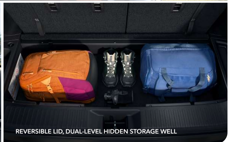
REVERSIBLE LID, DUAL-LEVEL HIDDEN STORAGE WELL