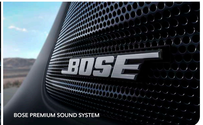
BOSE PREMIUM SOUND SYSTEM