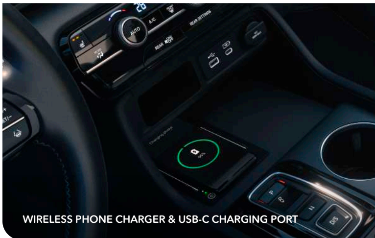
WIRELESS PHONE CHARGER & USB-C CHARGING PORT