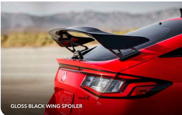
GLOSS BLACK WING SPOILER